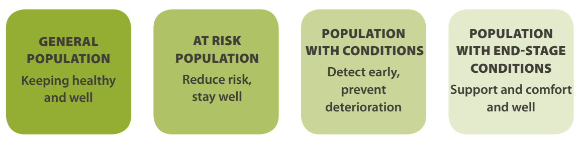
FIGURE 1 - POPULATION HEALTH CONTINUUM OF CARE

An increasing burden of long-term conditions is a worldwide issue as modern medicine reduces early death. This is particularly so in places with demographics like Hawke's Bay – an ageing population with areas of significant deprivation. New Zealand research shows that, generally, Māori develop ageing conditions about 10 years younger than non-Māori.